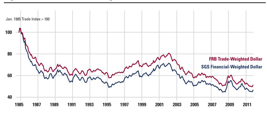
Figure 3: Financial- vs. Trade-Weighted Dollar Indicies